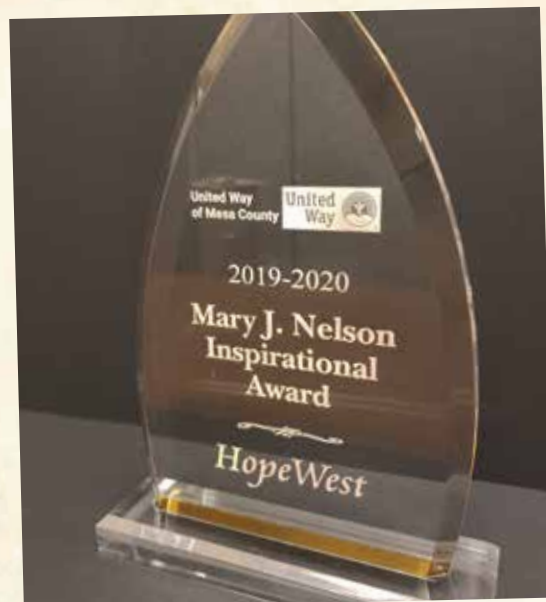
HopeWest was honored to be presented with the prestigious Mary J. Nelson Inspirational Award from United Way of Mesa County.